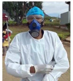
Nurse Nthomane ready to screen patients at the clinic

The memories of the pre-COVID-19 world that I've just written about seem so very long ago! Now our minds are preoccupied with lock downs, face masks, and hand sanitizer! Fear swept through the nation of Lesotho as dozens became sick just on the other side of the border in South Africa. One morning as I went into a Chinese-owned supermarket, the panic was tangible. A lady near the door recognized me and greeted me as a pastor. Two other ladies overheard and stopped me, asking if I would pray for them. As we bowed our heads in the corner of the store, one of the cashiers stopped us and motioned for me to come to the PA system and pray with everyone. Shocked, I introduced myself to the shoppers and prayed for God's peace and protection over each one. The presence of God came down in the grocery store, and the tension lifted.