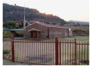
Mauersnek church building