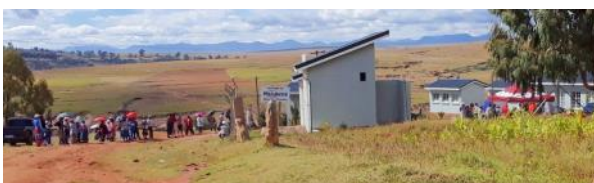
Patients waiting to be screened at the clinic

The government of South Africa reacted to the new threat on March 26 by implementing one of the strictest lock down policies in the world. People were not even allowed to go out of their