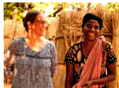
Relationships lead to discipleship

To be truly effective, theological training involves more than textbooks and diplomas. Leaders must become disciples of Christ. While technology makes it possible to help many pastors remotely, we are finding our most effective ministry happens face-to-face.