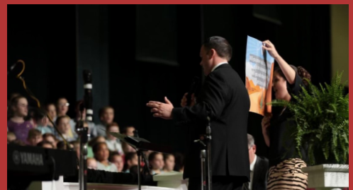
Leading the children's choir at IHC

Several also testified to giving their lives to Christ. We were so thankful for the closeness of God's presence during our services and for Him speaking to the children as only He can!