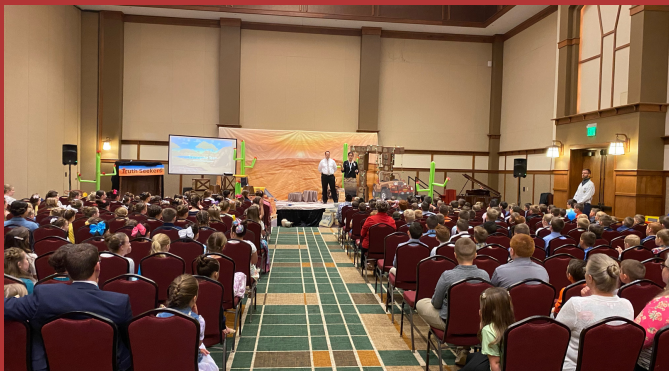
Chapel of the Children at IHC