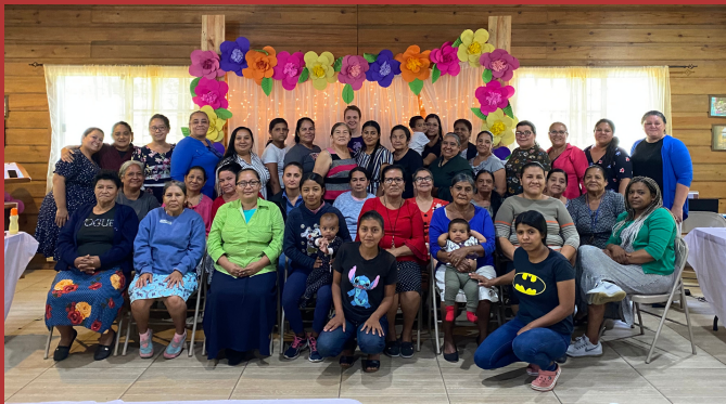
Ladies' Retreat 2023