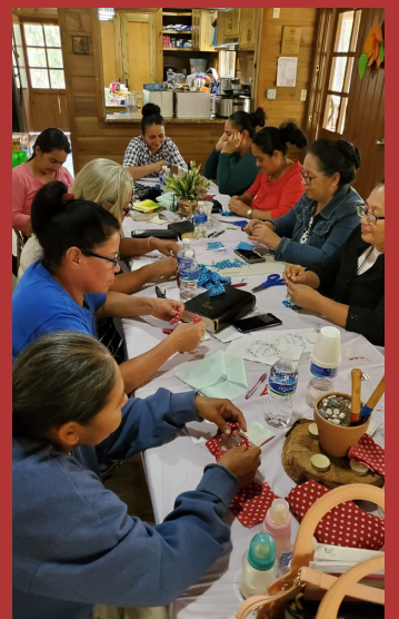
Enjoying crafts and games