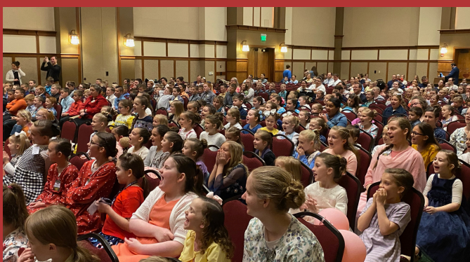
The kids laughing at the puppet