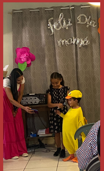
The children enjoying participating on Mother's Day