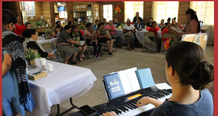
Learning new choruses together