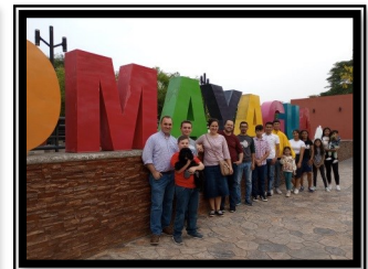
A youth outing to the town of Comayagua