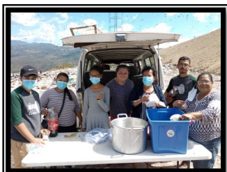
A team from our Tiloarque church handing out tamales at the city dump