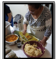
Church ladies preparing tamales to hand out

Thank you for your faithful prayers and your generous giving .