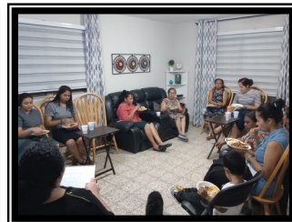
Ladies' meeting in our home