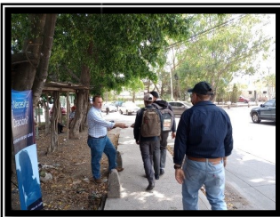
Witnessing and handing out tracts in our community