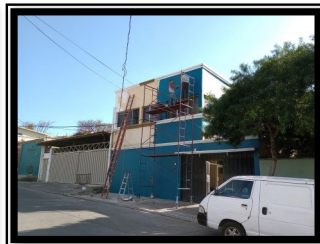
Painting our Tiloarque church