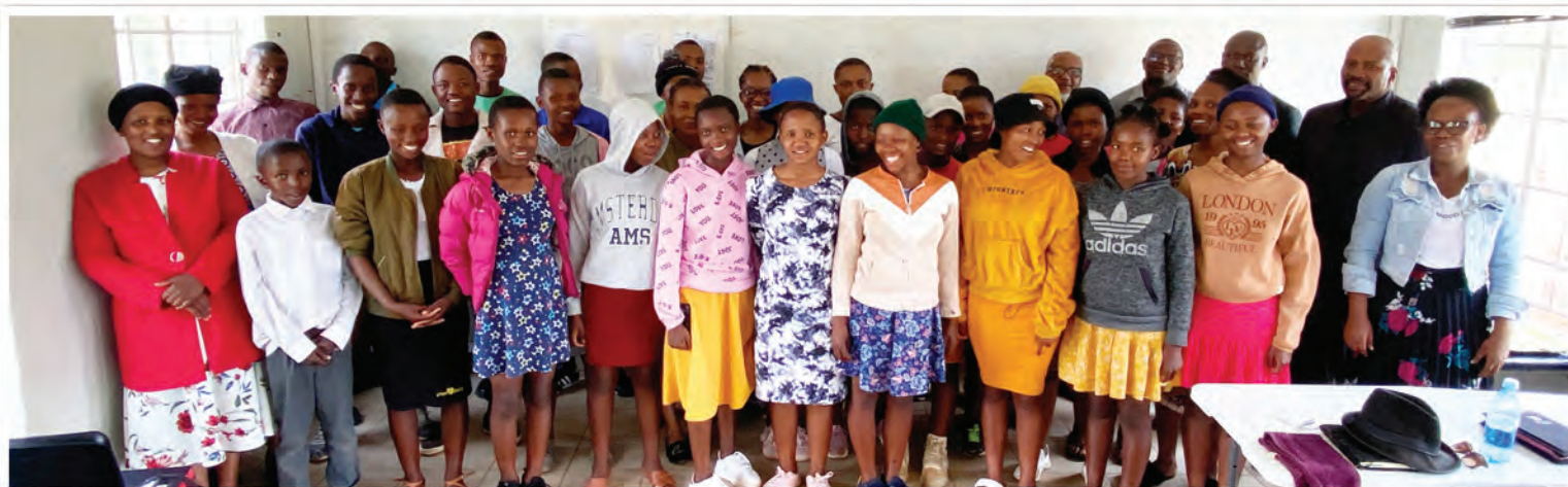
OVC students and staff at the December conference

In December when the school year ended, a conference was held for the OVC sponsored children and young people. It was a wonderful two days with special services, counseling, games, and lots of food. One young lady gave her heart to Christ, and several others testified how God worked in their lives during this conference.