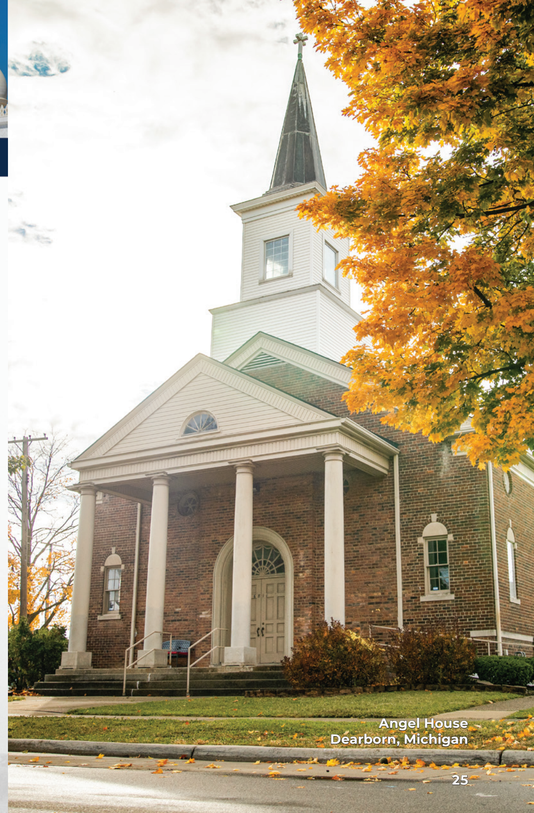
Angel House Dearborn, Michigan

Times Available: Multiple times available throughout the year