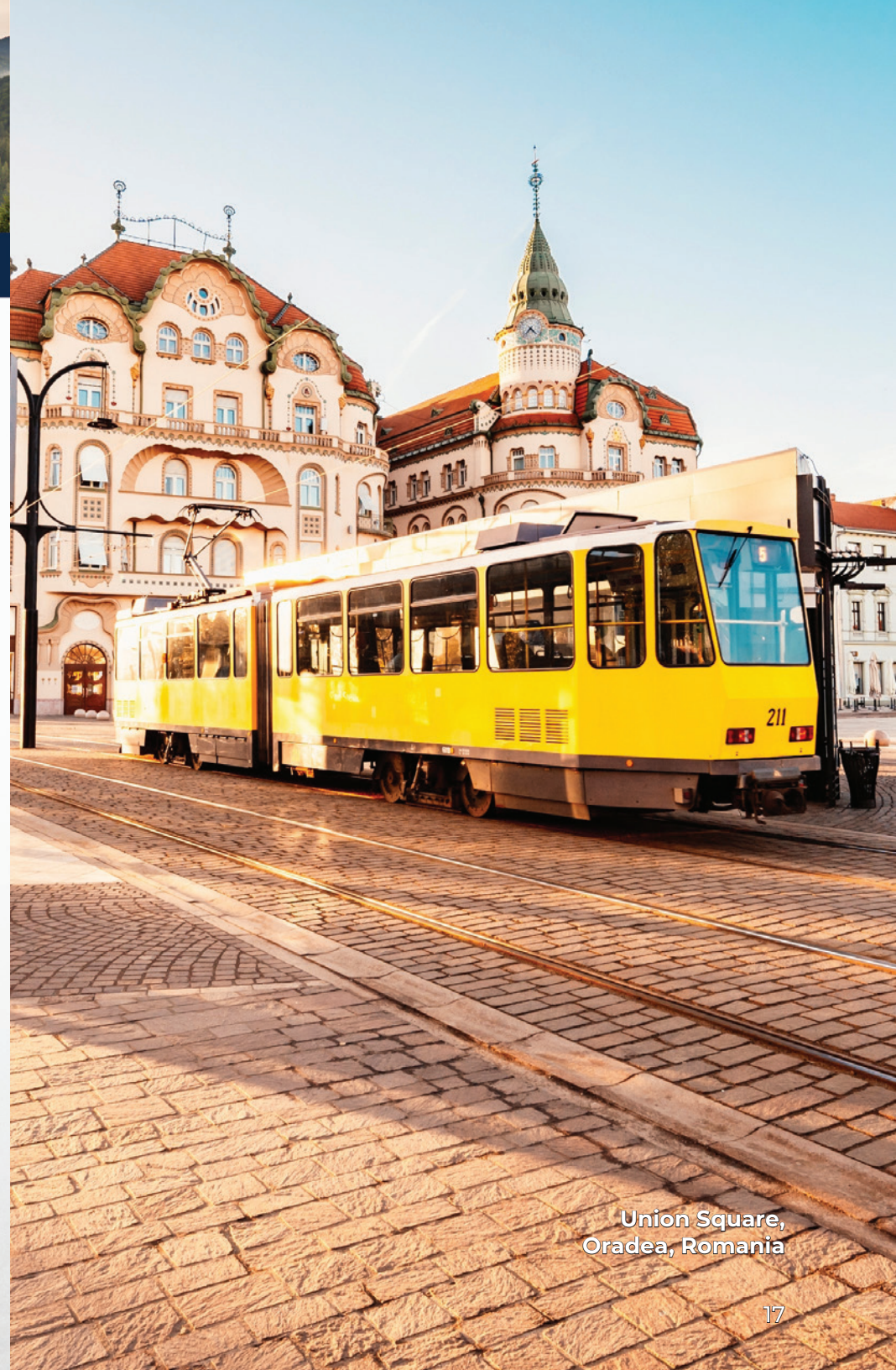
Union Square, Oradea, Romania

Times Available: Fall internship beginning mid-September