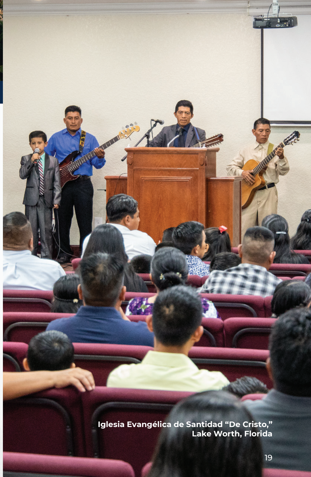
Iglesia Evangélica de Santidad "De Cristo," Lake Worth, Florida

Times Available: Multiple times available throughout the year