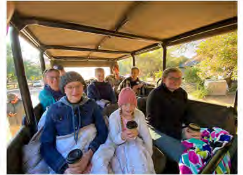
Makeing Memories with Friends