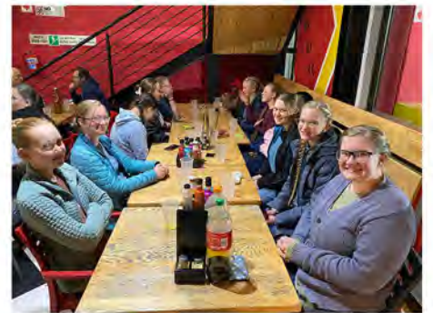
TLC Team and Missionary Kids