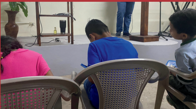
Using their Bibles in church