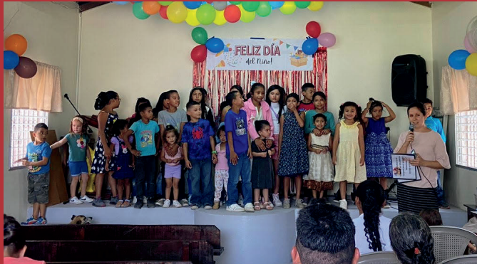
A great group for Children's Day