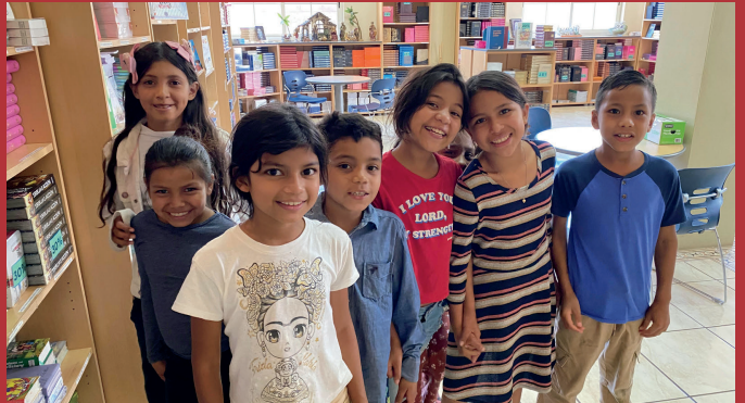
A reward trip to the Bible Society