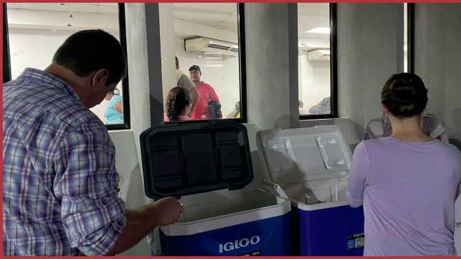
Friends came to visit and help out!