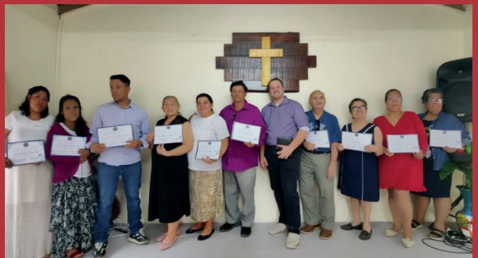
Discipleship and baptism candidates

God is still at work in Honduras! While we are away for six months to reconnect with supporters and share what God is doing in Honduras, our national leaders are guiding the church. They have already been doing an awesome job and are excited to minister for the Lord. As we complete our home assignment, we have reflected on the past and are now looking forward to the future. On our next term we plan to continue what we have been doing, further develop our afterschool program, and work to better train our Christian leaders. We appreciate your prayer and financial support during our first term of ministry in Honduras and your ongoing support for the future. May God richly bless you as you labor with us for the kingdom!