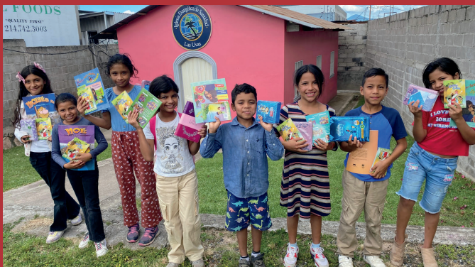
Nine children earned their very own Bible!