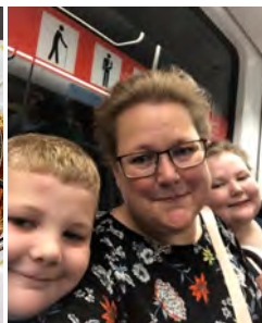
Going to church on the metro