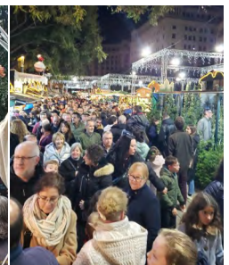
Thousands of people at the Christmas market