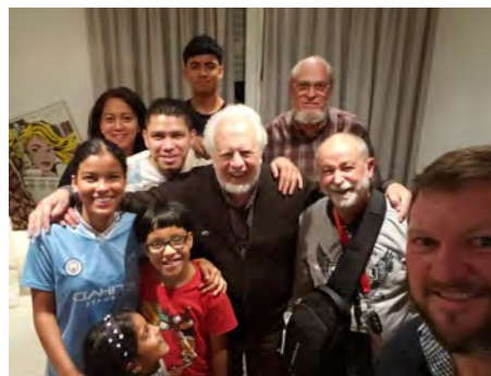
Small group with a Honduran family