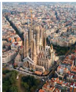
La Sagrada Familia- The Sacred Family