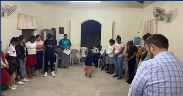
Tuesday evening Bible study