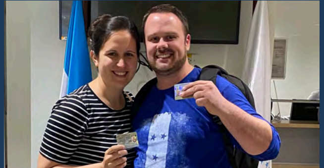
We finally received our Honduran residencies!