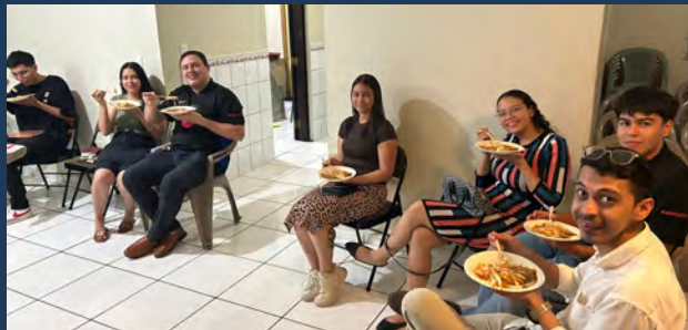
Our first youth night back