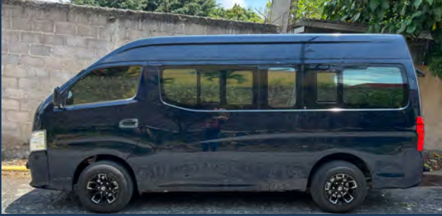
Our new bus!