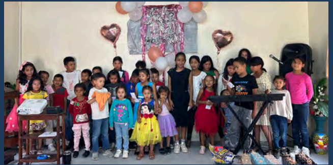
Children singing a special song for Mother's Day