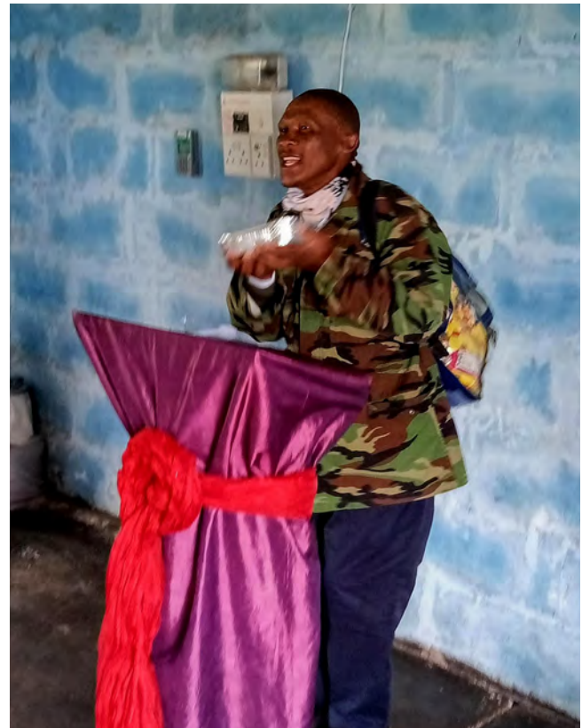
A man who got saved through the radio ministry

Lesotho is being filled with the knowledge of the Lord. •