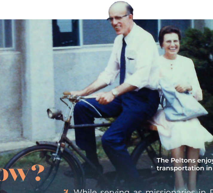
The Peltons enjoying simple transportation in Taiwan