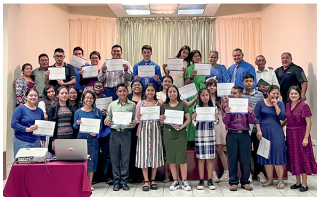
Ministry in Salamanca, Mexico

We are in a new year. What never changes is the mission. One thing remains crystal clear for us—God's redemptive and reconciliatory mission marches on. It will prevail in people's lives in the world. Let's join it! •