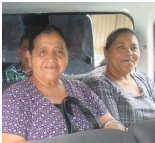
She loved serving.