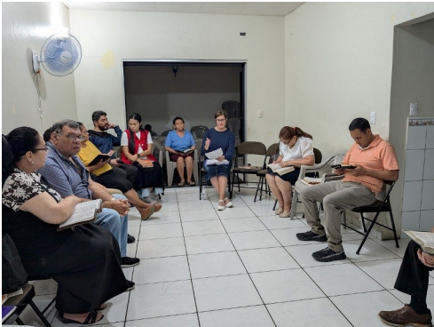
A Wednesday night Bible study group going through the book of John