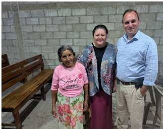
This precious lady walks four hours to church and four hours back home every Sunday!