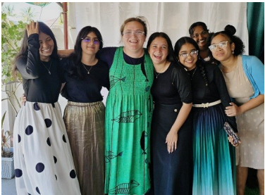
Making new friends