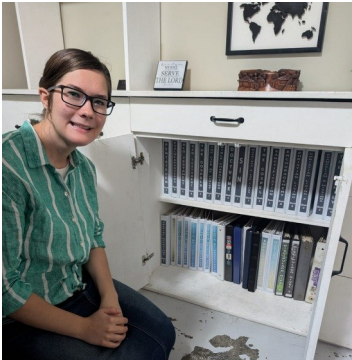
Sermons all organized!