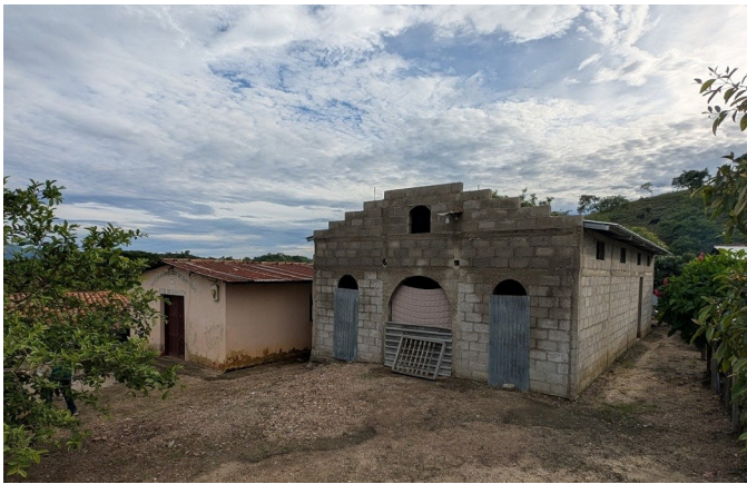
The new church building