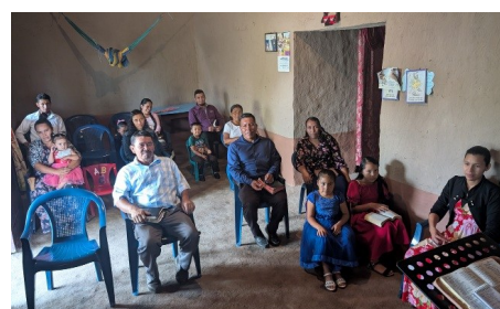
The house church in Quelepa