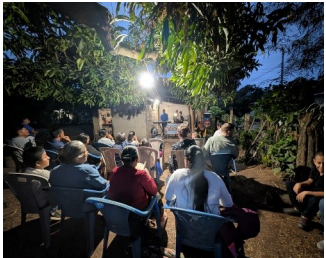
A service in Santa Rosa