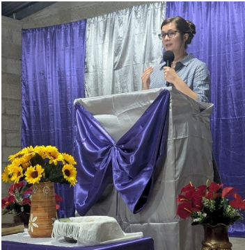
Speaking in Nicaragua