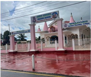
One of the many Hindu temples that dot the landscape. Nearly 25% of the population identify as Hindu.