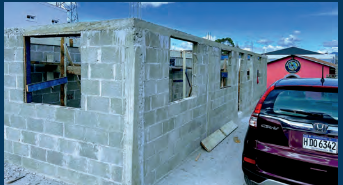
Our new children's chapel is underway.