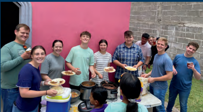
The Noblesville team was a huge blessing.