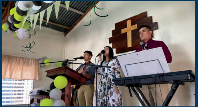
The Garcias were excellent evangelists!