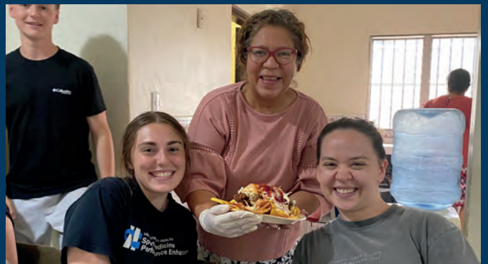
One of their favorite Honduran foods - Pollo Chuco