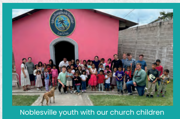
Noblesville youth with our church children