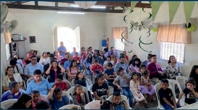
Youth Revival Sunday