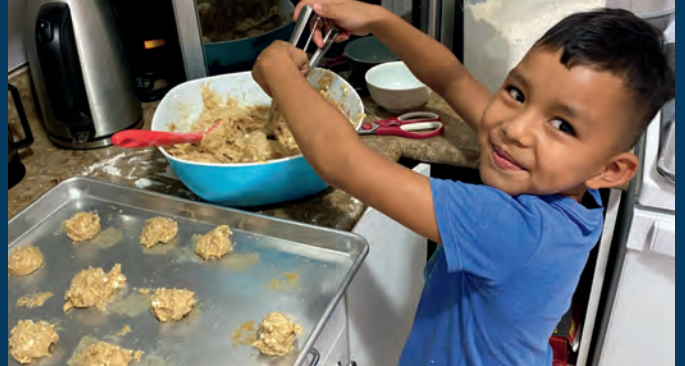
Making snacks at our house