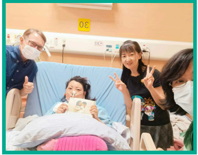
Church members receiving copies of Is God Really My Father?

With the increasing busyness, time seems to move more quickly. Many doors have been opened, and yet we can only walk through one at a time. The upcoming summer English camps will provide even more opportunities to minister. At the same time more laborers are still needed to work in the field. Pray that God would send more workers here. Also continue to pray for the other missionaries and me, that we would be strengthened and given wisdom to faithfully represent Christ.