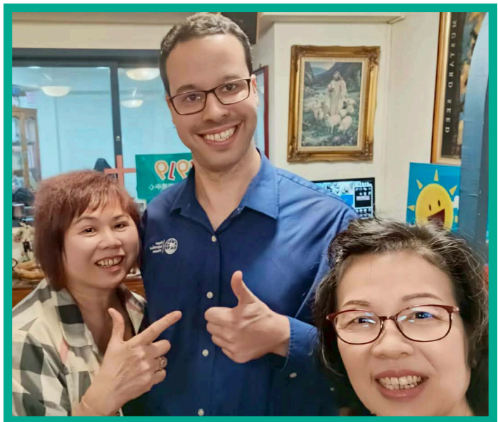
Meeting new friends and receiving prayer requests