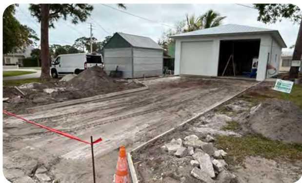
New GPM and FEA storage building

Today's residents of Sea Breeze Community enjoy far more conveniences than those who first built the roads, cleared the Florida brush, and established the early structures. Yet as we prepare the campus and facilities for Sea Breeze Camp 2026, our prayer remains the same—that we will worship the same faithful God, rejoice in His love and mercy, and faithfully do our part in the body of Christ. Welcome to South Florida and Sea Breeze Community!