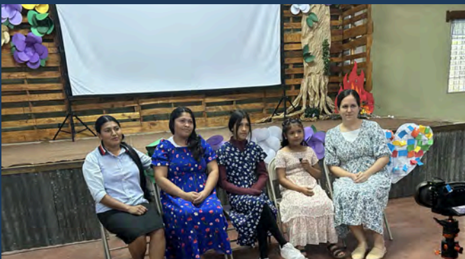
Las Uvas Ladies at Women's Retreat