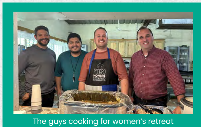
The guys cooking for women's retreat

As our relationships continue to deepen, the last two months have been filled with church services, youth nights, meetings with church lay leaders, reading classes, and music lessons. We are especially thankful that four of our church members are now taking piano and violin lessons. We feel strongly that music is a wonderful way for young people to become involved in church and worship the Lord with their talents!