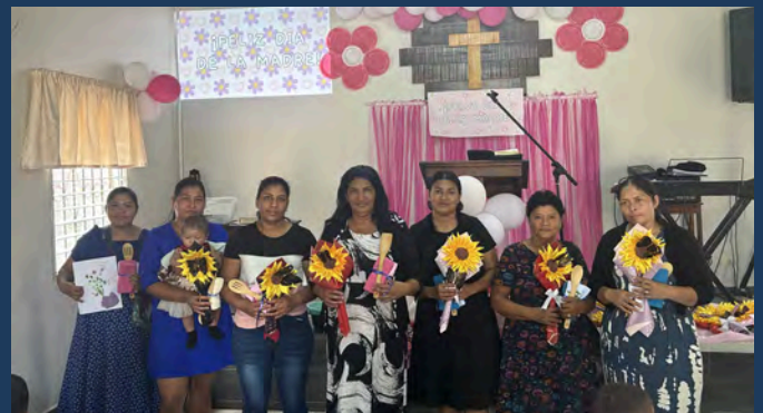
Mother's Day celebration

Many of you have asked about our adoption process, and the answer is still: slowly. Each new document request from the Honduran government brings more delays, and we would greatly appreciate your prayers that we would be able to move on to the next step of the process!