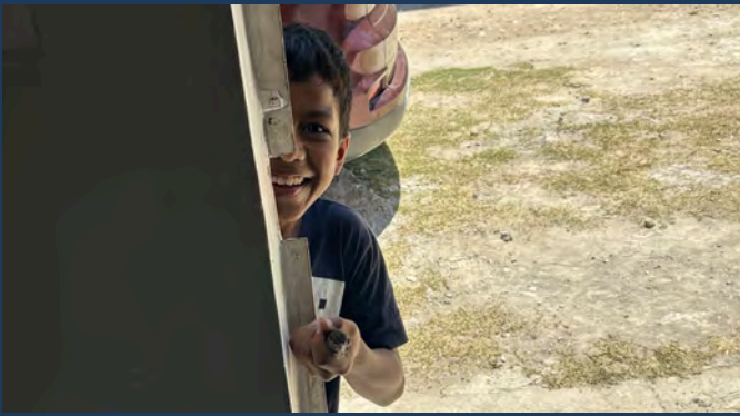
Lots of mischief trying to scare their teacher with a bird!