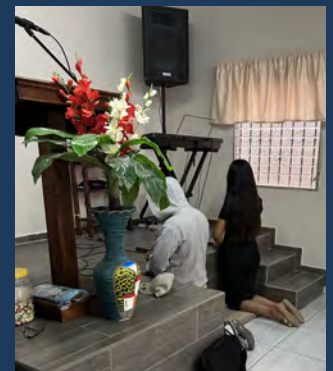
Early morning prayer meetings at church