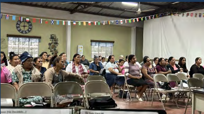
A beautiful crowd of women at Ladies' Retreat