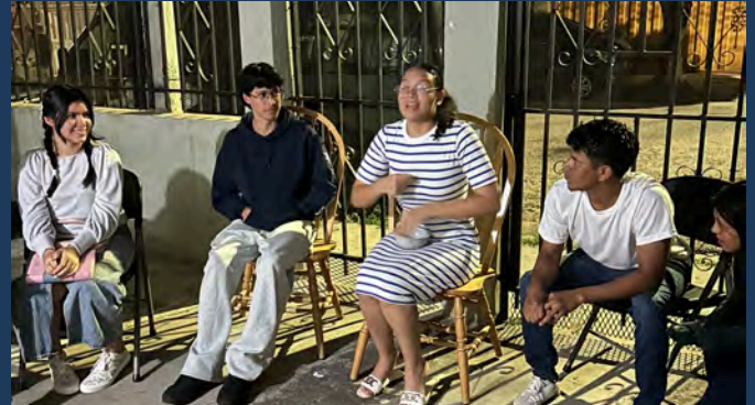
Game night with the youth